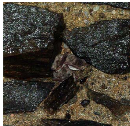
From left to right: cluster of bats of the mixed maternity colony, M. blythii mating and M. capaccinii hibernating in the roost site